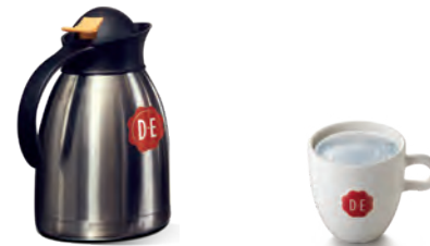
Black coffee jug Hot water