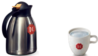
Black coffee jug Hot water