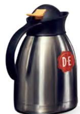
Hot Chocolate jug